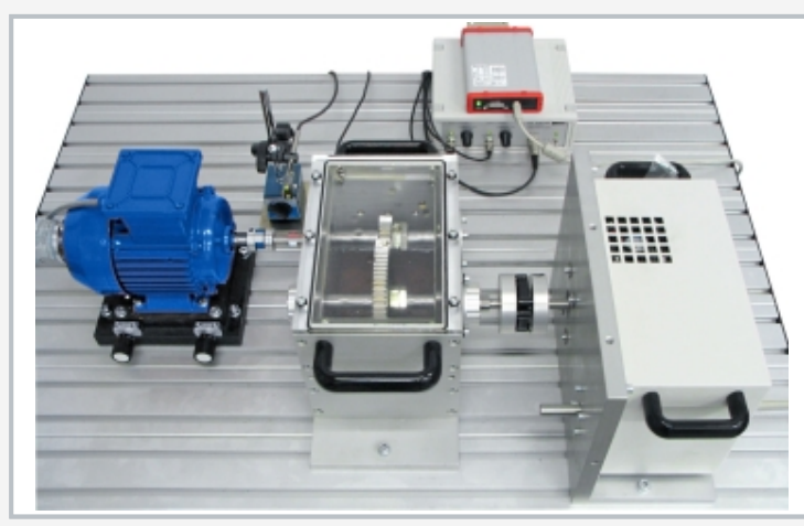
The illustration shows PT 500.15 together with PT 500, PT 500.01, PT 500.05 and PT 500.04