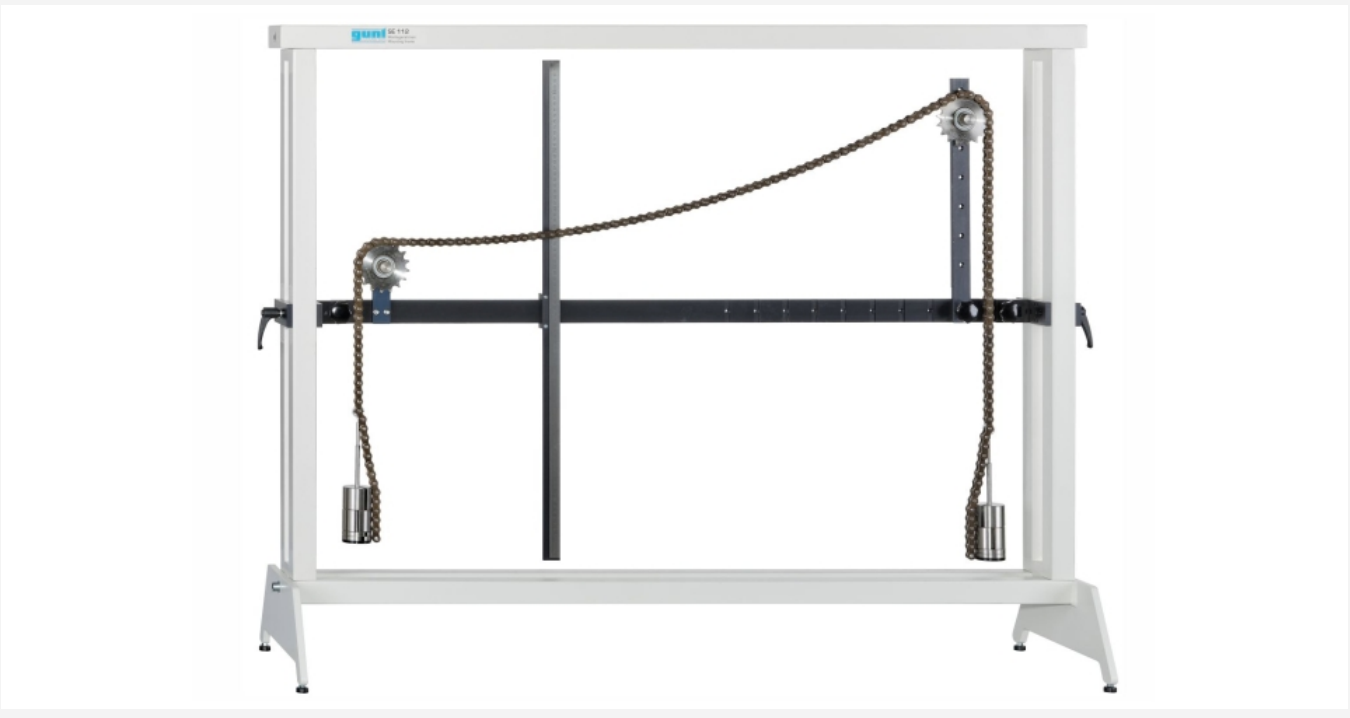
The illustration shows SE 110.50 in the frame SE 112