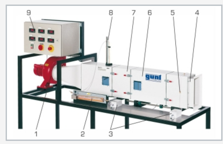
1 fan with throttle valve, 2 inclined tube manometer, 3 differential pressure sensor, 4 streamlined inlet, 5 pressure measurement via measuring nozzle, 6 air duct with windows, 7 measuring section for exchangeable accessories, 8 Pitot tube, 9 displays and controls