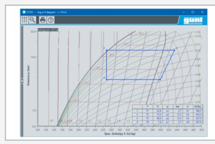
Software screenshot: log p-h diagram

T temperature, P pressure, F flow rate, P_{\rm el} power, PSH, PSL pressure switch; blue/red: refrigeration circuit, green: hot water circuit, light blue: cooling water