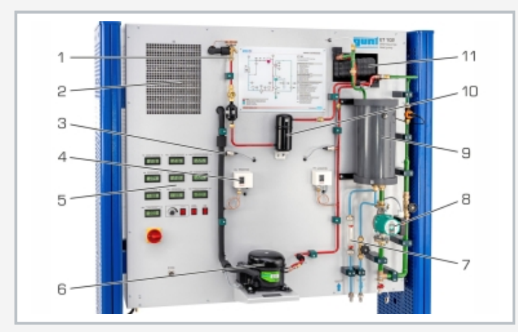
1 expansion valve, 2 evaporator with ventilator, 3 pressure sensor, 4 pressure switch, 5 displays and controls, 6 compressor, 7 cooling water flow meter, 8 pump, 9 hot water tank, 10 receiver, 11 cocondenser