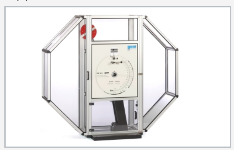
Protective cover for pendulum impact tester WP 410.50 available as an accessory