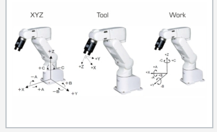
Jog modes XYZ: coordinate system of robot Tool: coordinate system of hand Work: user-defined coordinate system