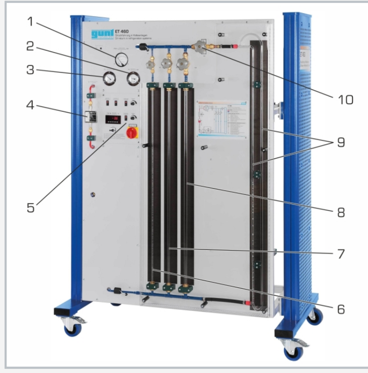
1 manometer differential pressure, 2 manometer delivery side, 3 manometer intake side, 4 flow meter, 5 display and control elements, 6 rising pipe \emptyset 6mm, 7 rising pipe \emptyset 10mm, 8 rising pipe \emptyset 14,4mm, 9 double rising pipe, 10 valve for rising pipe selection