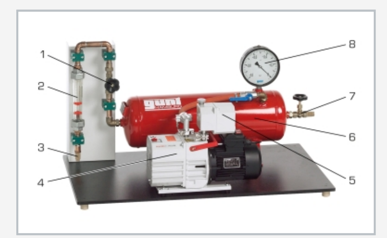
1 needle valve, 2 flow meter, 3 silencer, 4 rotary vane pump, 5 oil separator, 6 pressure vessel, 7 needle valve with silencer, 8 manometer