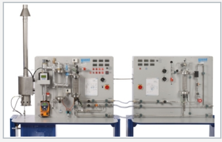
Left: ET 850 steam generator; right: ET 851 axial steam turbine; set up ready for operation, together they form a steam power plant