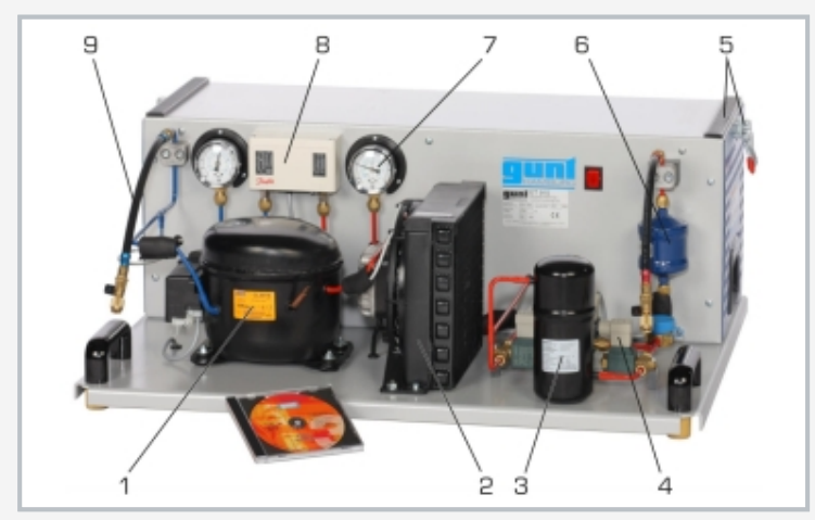
1 compressor, 2 condenser with add-on fan, 3 receiver, 4 solenoid valve, 5 frame to mount the models, 6 filter/dryer, 7 manometer, 8 pressure switch, 9 refrigerant hose