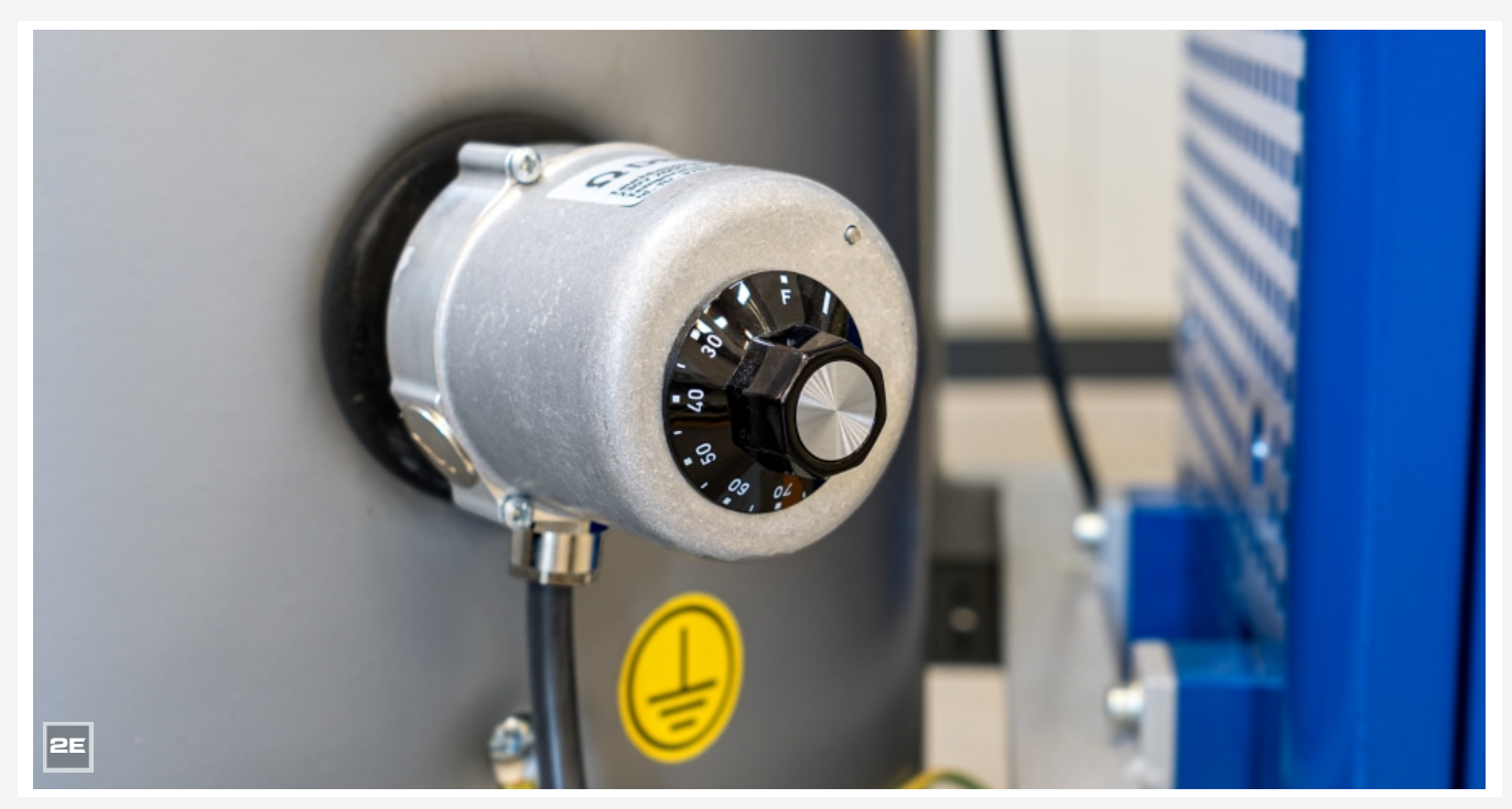
HL 320.02 heater installed in the bivalent storage tank of HL 320.05