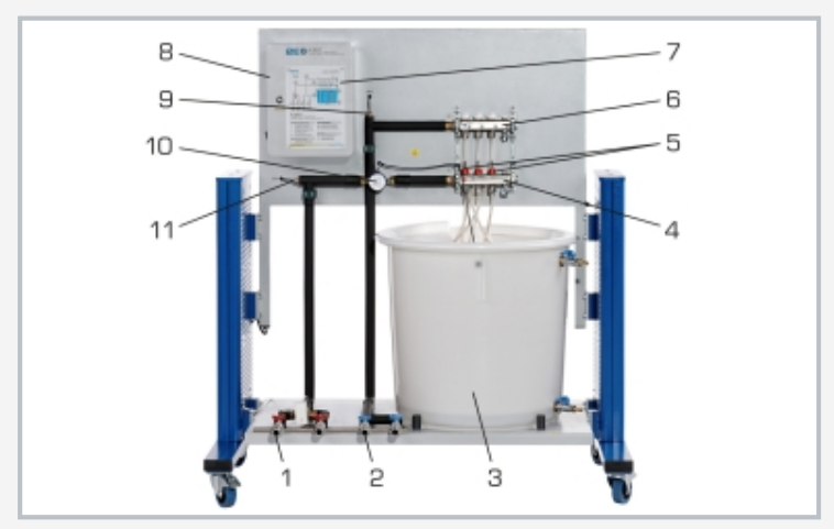
1 connection for feed, 2 connection for return, 3 tanks for hot and cold water, 4 feed distributor, 5 flow meter, 6 return distributor, 7 info panel, 8 connection box for sensors, 9 return temperature sensor, 10 flow meter, 11 return temperature sensor