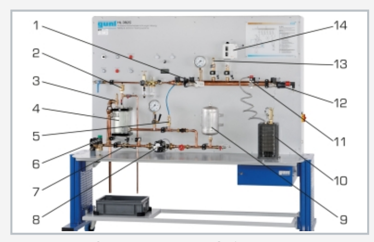
1 thermostatic valve, 2 quick-action ventilating valve, 3 safety valve, 4 air separator, 5 nonreturn valve, 6 pressure reducing valve, 7 flow switch, 8 pump, 9 expansion vessel, 10 heater, 11 thermal discharge safety device, 12 temperature controller, 13 safety valve, 14 safety pressure cut-out