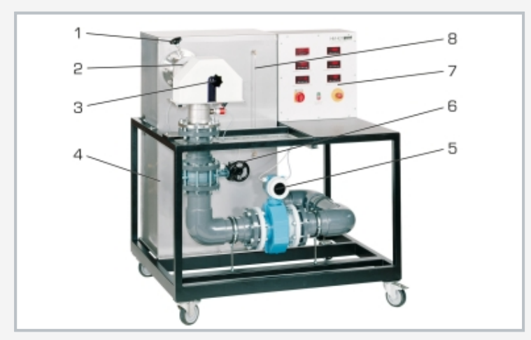
1 lever for adjusting the guide vanes, 2 Propeller type turbine, 3 brake, 4 tank with submersible pump, 5 flow rate sensor, 6 handwheel for throttle valve, 7 switch cabinet, 8 level indicator for tank