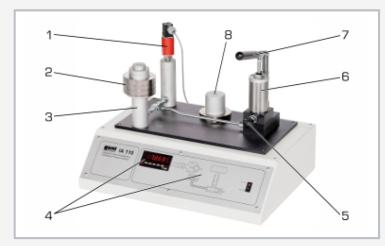
1 pressure sensor being calibrated, 2 loading device: weight carrier with piston and weights, 3 cylinder, 4 digital display for displaying the output signal and process schematic, 5 manual adjustment to relieve the pressure, 6 compensating cylinder, 7 pump lever for the compensation cylinder, 8 holder for weight carrier