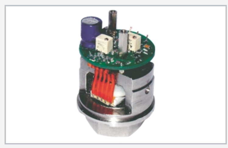
Interior layout of an electronic pressure sensor