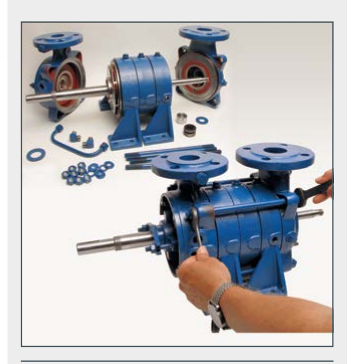
MT 181 Assembly & maintenance exercise: multistage centrifugal pump

In the worst case, an unexpected failure of pumps and compressors may result in a standstill of the entire process engineering system. It is therefore essential that these components are serviced and maintained by qualified experts.