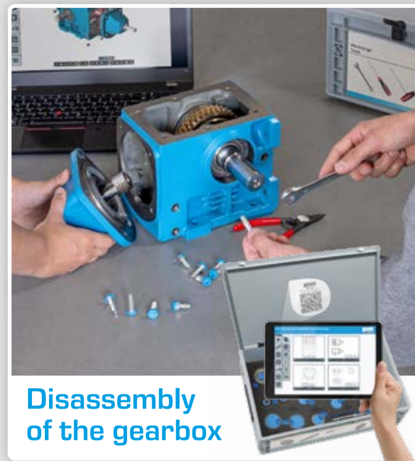
Disassembly of the gearbox

Planning education elements and teaching sequences for a complex learning project