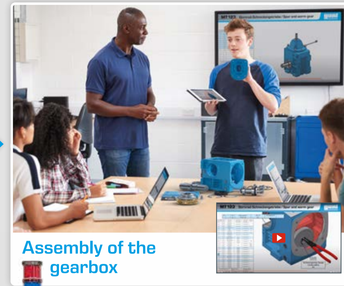
Assembly of the gearbox