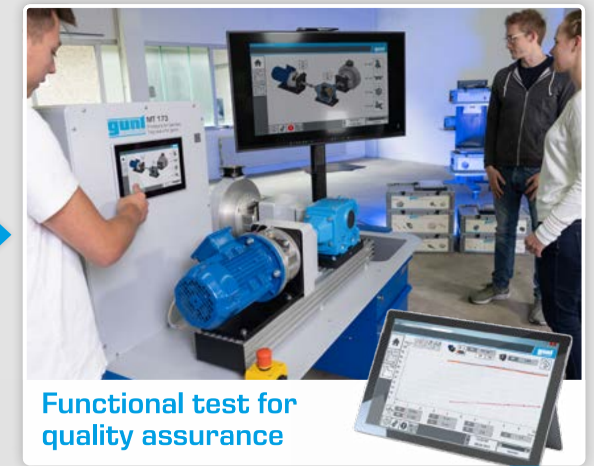
Functional test for quality assurance