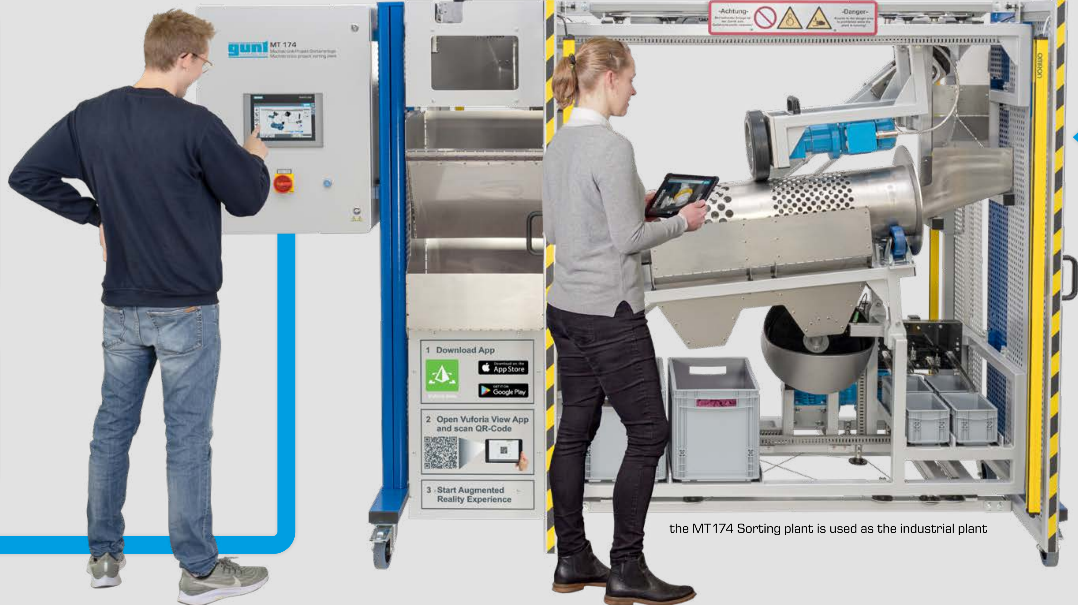
the MT174 Sorting plant is used as the industrial plant