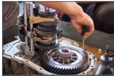
Joining (DIN 8593)

The entire assembly process comprises the assembly operations: