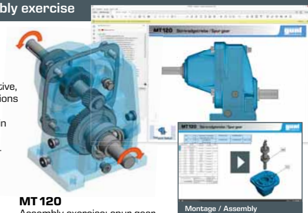
MT 120 Assembly exercise: spur gear

GUNT attaches great importance to innovative, state-of-the-art solutions and modern ways of imparting knowledge in the preparation of instructional material.