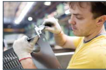
Handling (VDI 2860)