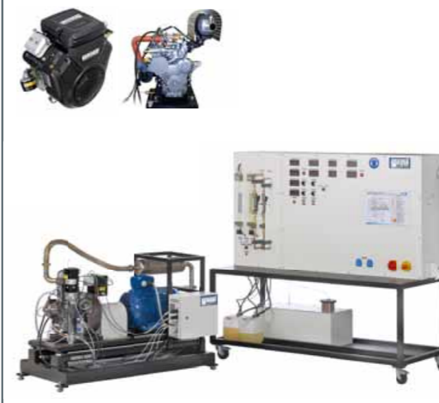
CT 300 Engine test stand, 11 kW