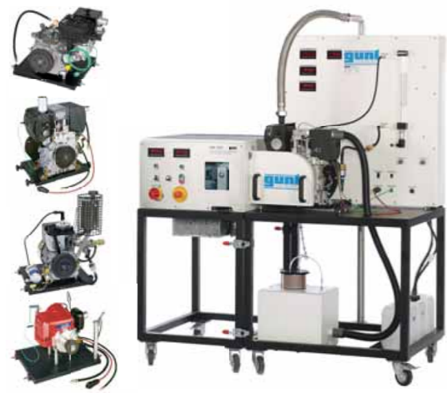
CT 159 Modular test stand for single-cylinder engines, 3,0kW