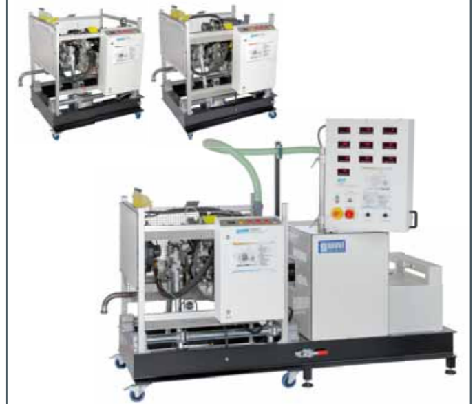
CT 400 Load unit, 75 kW, for four-cylinder engines