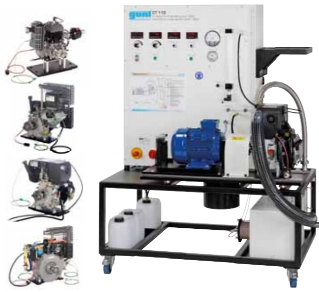
CT 110 Test stand for single-cylinder engines, 7,5kW