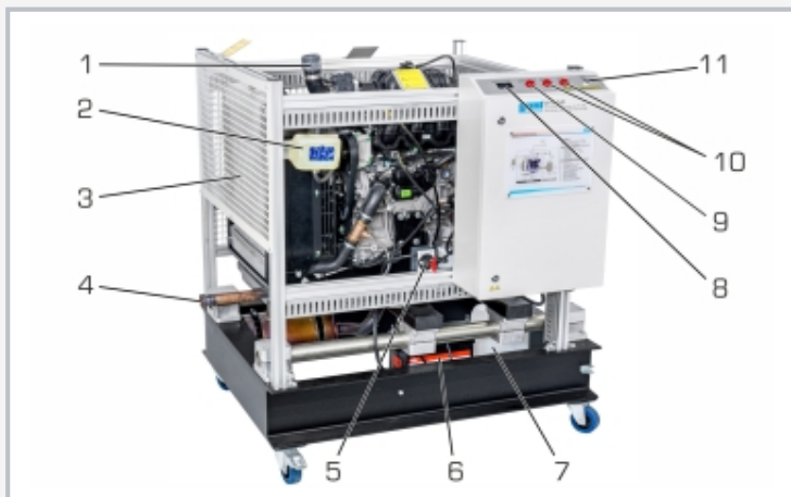
1 connection for engine feed air, 2 cooling water tank, 3 radiator with protective screen, 4 exhaust gas connection, 5 battery main switch, 6 battery, 7 fuel tank, 8 operating time counter, 9 engine control lamp, 10 warning lamps, 11 key switch for ignition