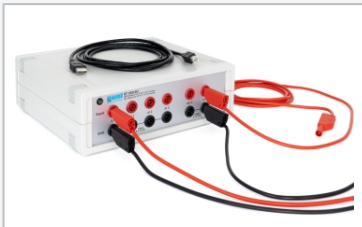
USB interface module