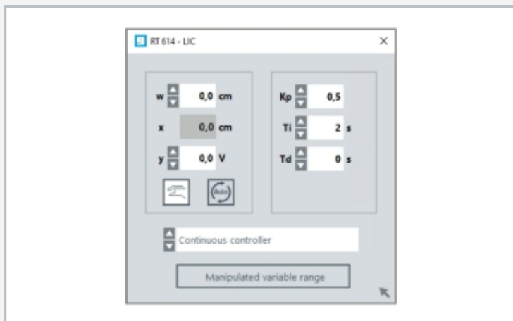
Screenshot: level control demonstration unit RT 614