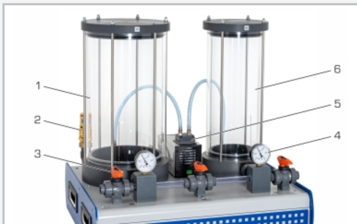
1 positive pressure tank, 2 safety valve, 3 ball valve, 4 manometer, 5 compressor, 6 negative pressure tank