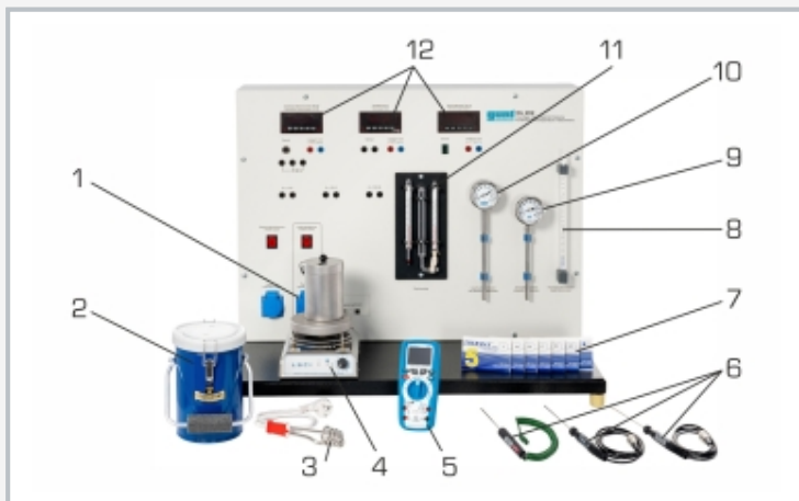
1 power-regulated socket, 2 vacuum flask, 3 immersion heater, 4 laboratory heater for water and sand, 5 multimeter, 6 temperature sensors, 7 temperature measuring strips, 8 liquid thermometer, 9 bimetal thermometer, 10 gas pressure thermometer, 11 psychrometer to determine air humidity, 12 digital display of temperature sensors