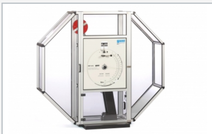
Protective cover for pendulum impact tester WP 410.50 available as an accessory