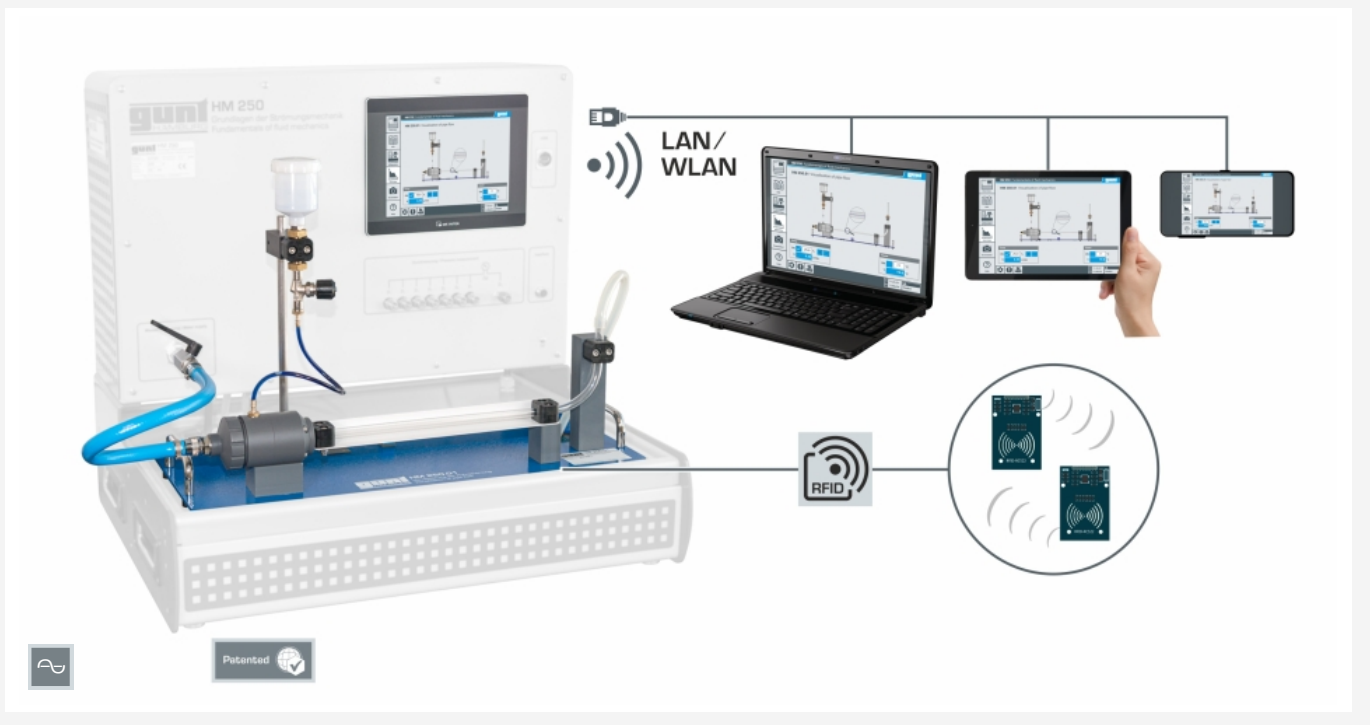
Complete experimental setup with the HM 250 base module, screen mirroring is possible on up to 10 end devices