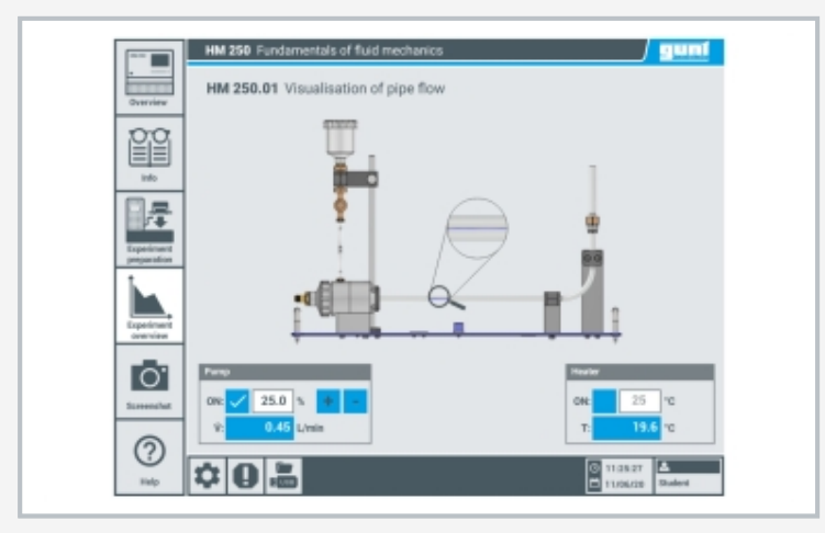
Intuitive user interface on the touch screen: experiment overview with adjustment of the flow rate and the temperature in the pipe section