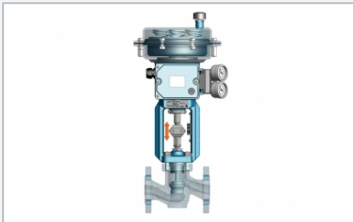
Transparent sectional view of the assembled gear (screenshot from assembly video)