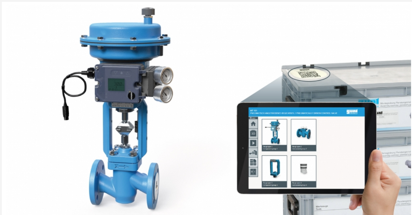
The illustration shows the assembled control valve and the GUNT Media Center on a tablet (not included)