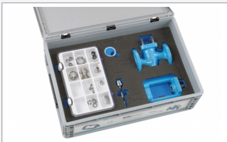
Storage system with foam inlay: all components have their place, the foam is labeled