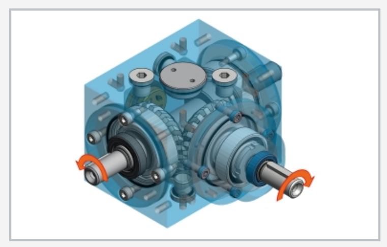
Transparent sectional view of the assembled gear