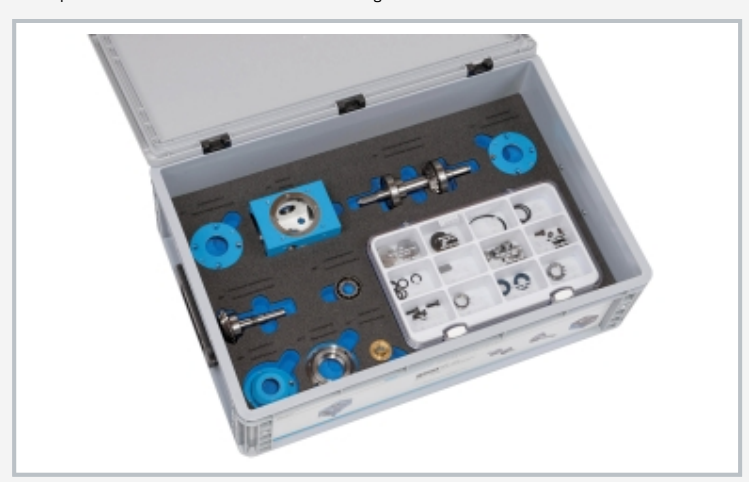
\ensuremath{\mathsf{MT}} 121: storage system with foam inlay, all components have their place, the foam is labeled