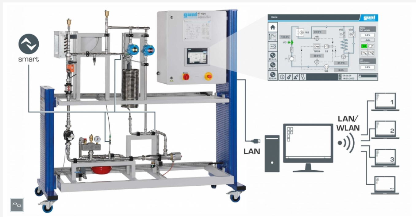
Control and operation via touch screen or a PC with GUNT software. Observation and analysis of the experiments at any number of workstations via LAN/WLAN.