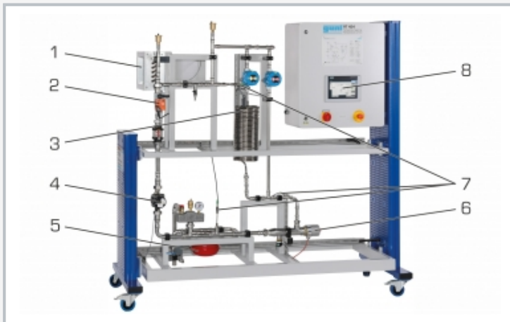
1 cooling unit (air/water heat exchanger with fan), 2 ball valve with motor drive, 3 process delay pipe section, 4 pump, 5 expansion tank, 6 heater, 7 smart temperature sensors, 8 touch screen