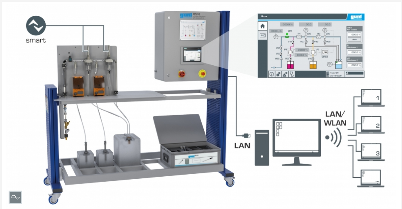
Control and operation via touch screen or a PC with GUNT software. Observation and analysis of the experiments at any number of workstations via LAN/WLAN.