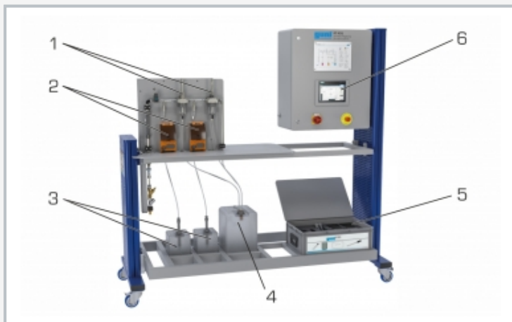
1 smart pH sensors, 2 metering pumps, 3 chemicals tanks, 4 product tank, 5 accessories, 6 touch screen