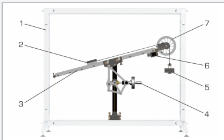
1 mounting frame SE 200, 2 friction body II, 3 inclined plane, 4 inclination adjustment, 5 counterweight, 6 measurement of the cable force, 7 flywheel to slow down the experiment