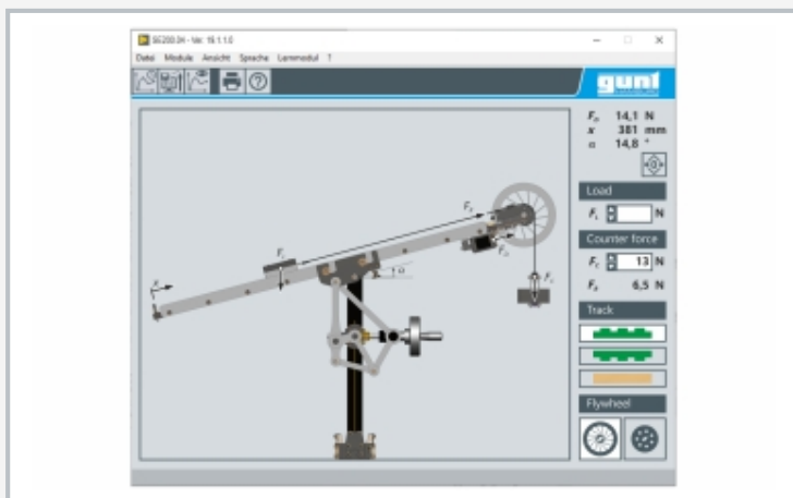
GUNT software screenshot: Display of forces and inclination angle, selection of friction surface and flywheels possible