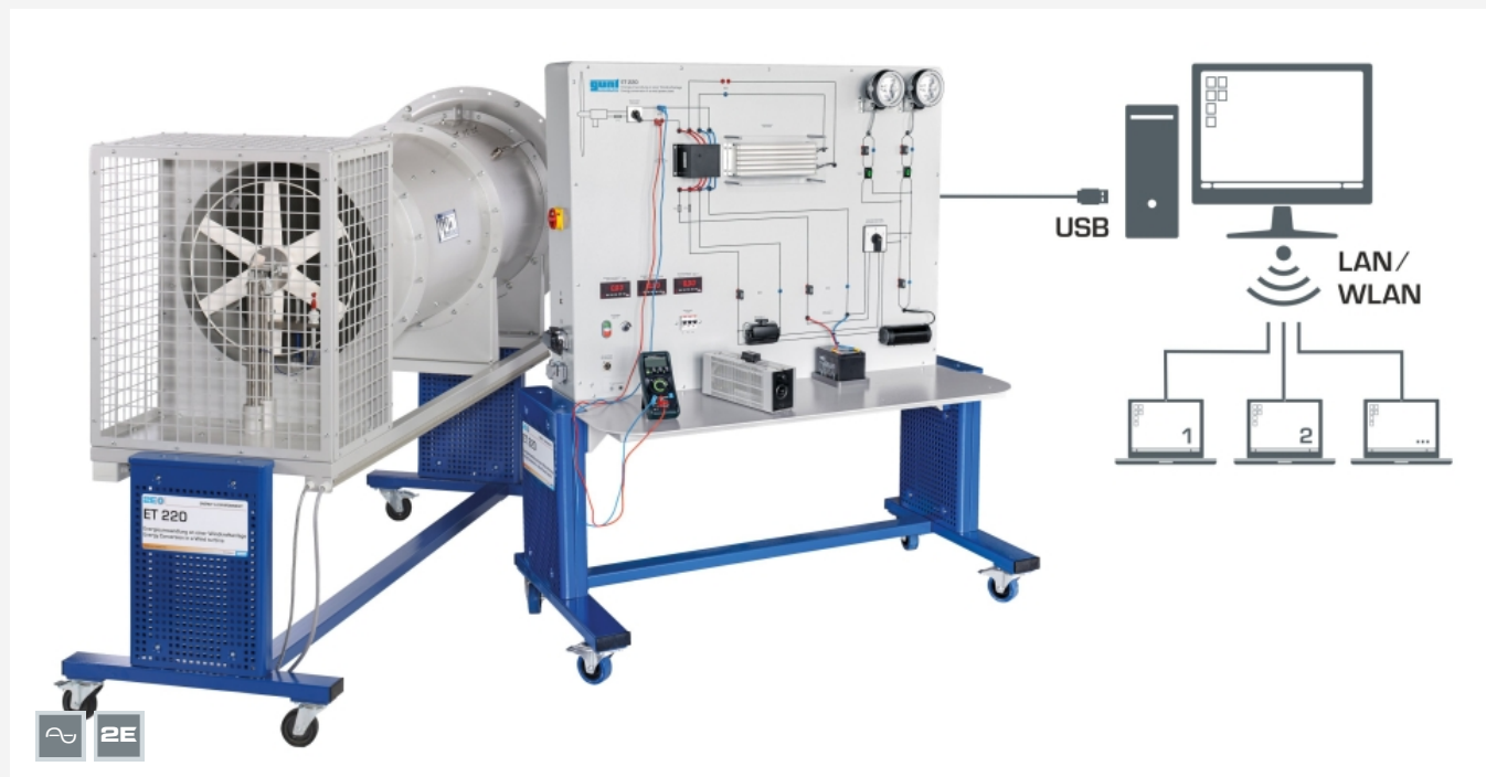
Network capable GUNT software for data acquisition: observation, acquisition, analysis of the experiments at any number of workstations via the customer's own LAN/WLAN network.