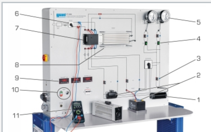
1 inverter, 2 accumulators, 3 current and voltage measuring point, 4 switch for electrical load, 5 bulbs as consumers, 6 wind power plant brake switch, 7 charge controller, 8 load resistances, 9 displays for wind velocities and speed, 10 control elements for axial fan, 11 multimeter