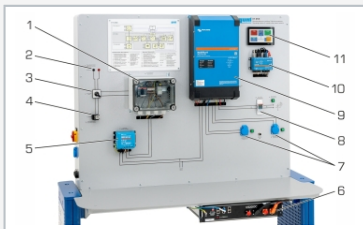
1 circuit breaker and overvoltage protection, 2 photovoltaic simulator connection, 3 toggle switch between photovoltaic simulator/photovoltaic modules, 4 photovoltaic modules connection, 5 MPP charge controller, 6 LiFePO accumulator, 7 alternating current consumers connection, 8 bidirectional electricity meter, 9 grid inverter, 10 communication and control unit, 11 touch screen