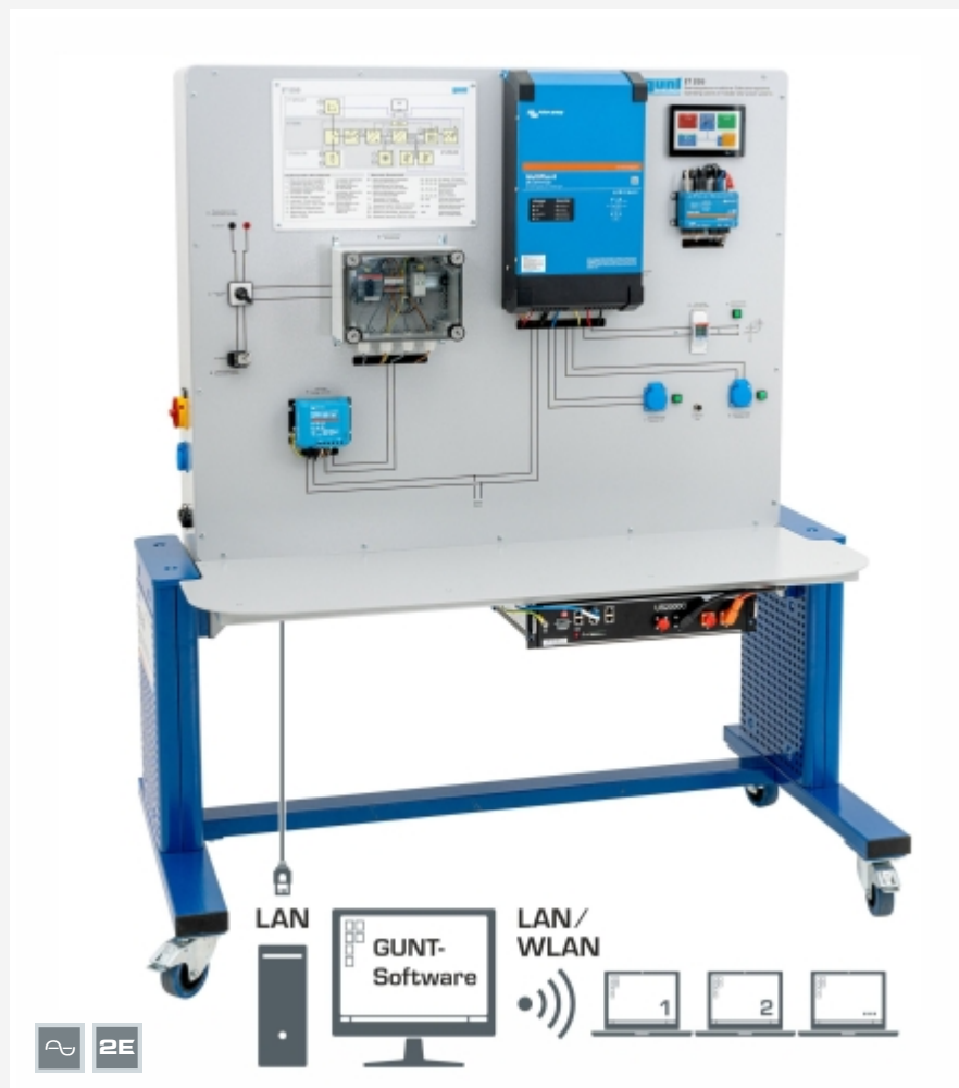
Network capable GUNT software: control and operation via 1 PC. Observation, acquisition, analysis of the experiments at any number of workstations via the customer's own LAN/WLAN network.