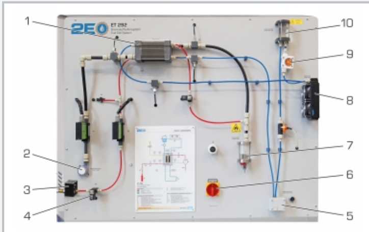
1 fuel cell, 2 cathode blower, 3 low-pressure reducing valve, 4 inlet valve, 5 cooling water pump, 6 main switch, 7 water separator, 8 water cooler, 9 visual flow indicator, 10 cooling water tank