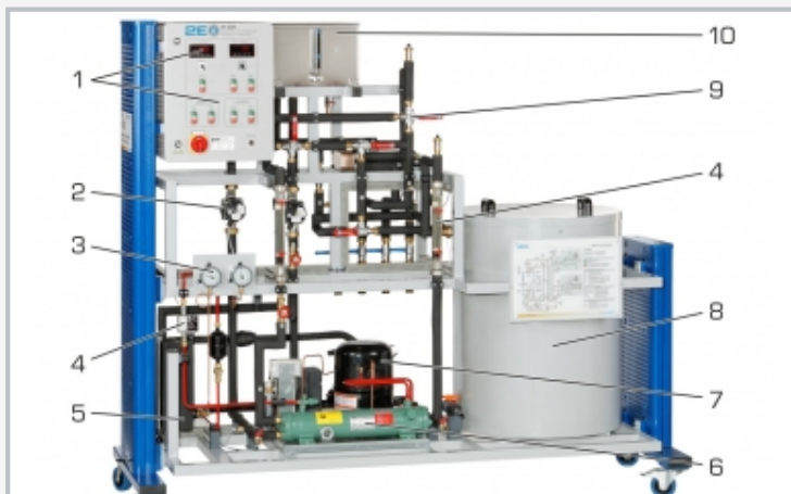
1 displays and controls, 2 pump, 3 manometer, 4 flow meter, 5 evaporator, 6 condenser, 7 compressor, 8 ice store, 9 3-way valve, 10 compensation tank (glycol-water mixture)