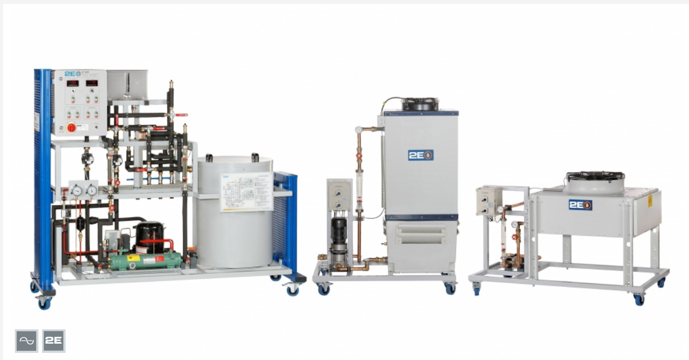
The illustration shows the trainer on the left, the wet cooling tower in the middle and the dry cooling tower on the right.