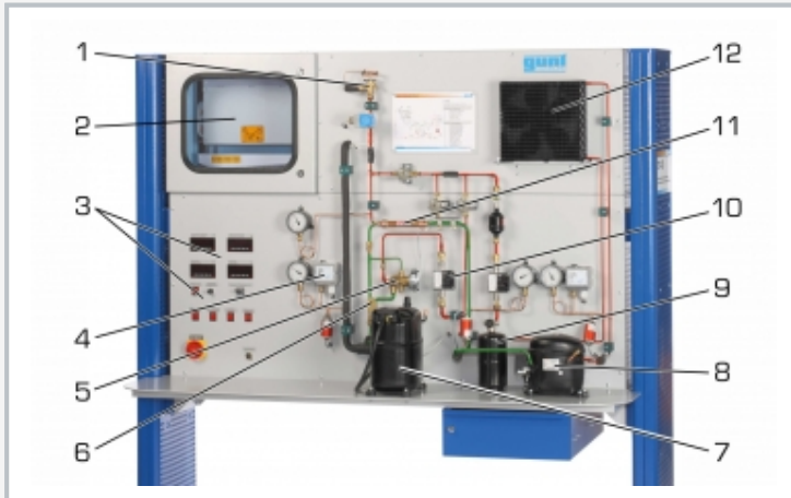
1 expansion valve, 2 refrigeration chamber, 3 displays and controls, 4 pressure switch, 5 injection valve, 6 injection cooler, 7 LP compressor, 8 HP compressor, 9 receiver, 10 flow meter, 11 heat exchanger, 12 condenser