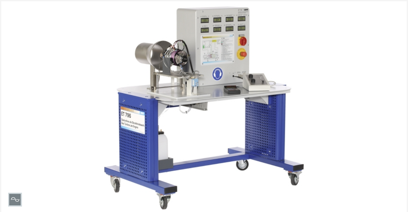
The illustration shows the jet engine without the protective grating