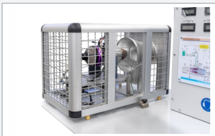
protective grating for the jet engine