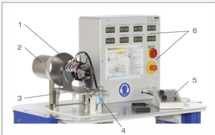
1 jet engine, 2 mixing pipe, 3 turbine platform, 4 force sensor for thrust measurement, 5 gas turbine controls, 6 displays and controls trainer