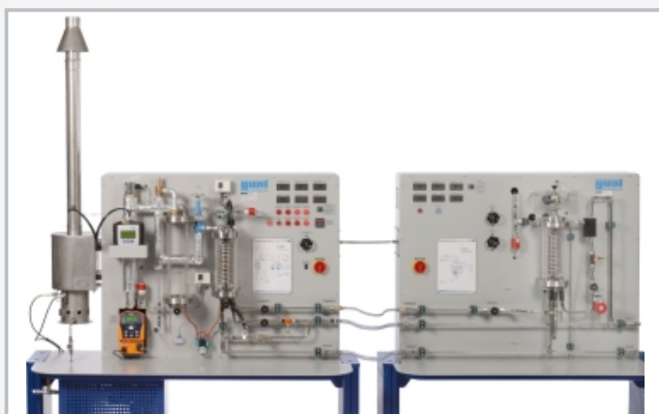
Left: ET 850 steam generator; right: ET 851 axial steam turbine; set up ready for operation, together they form a steam power plant