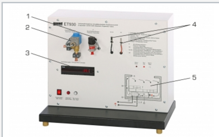
1 pressure sensor, 2 electronic expansion valve, 3 display of the refrigeration controller, 4 temperature sensor, 5 diagram of the simulated freezer