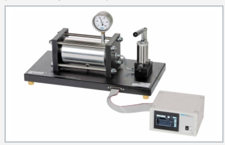
Example application: FL 152 in conjunction with FL 140 (stress and strain analysis on a thick-walled cylinder)