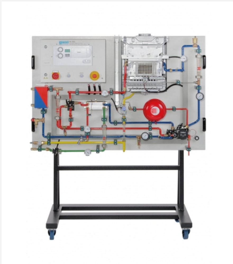
The illustration shows a similar unit.