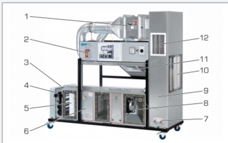
1 fire protection flap, 2 hand-held measuring unit pressure, 3 weather louvre, 4 multi-leaf damper, 5 filter, 6 heat exchanger, 7 inspection cover, 8 ventilator with drive motor, 9 air duct, 10 sound insulation link, 11 ceiling vent, 12 wall vent