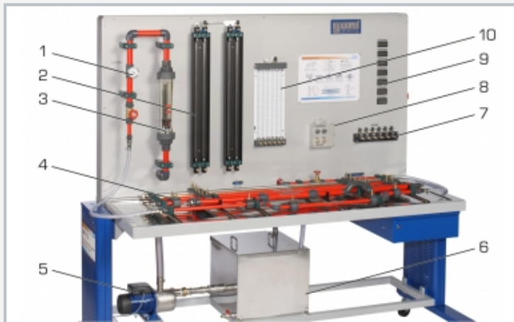
1 thermometer, 2 twin tube manometer, 3 rotameter, 4 different pipe sections, 5 pump, 6 storage tank, 7 pressure sensor, 8 differential pressure meter, 9 digital pressure indicators, 10 6 tube manometers