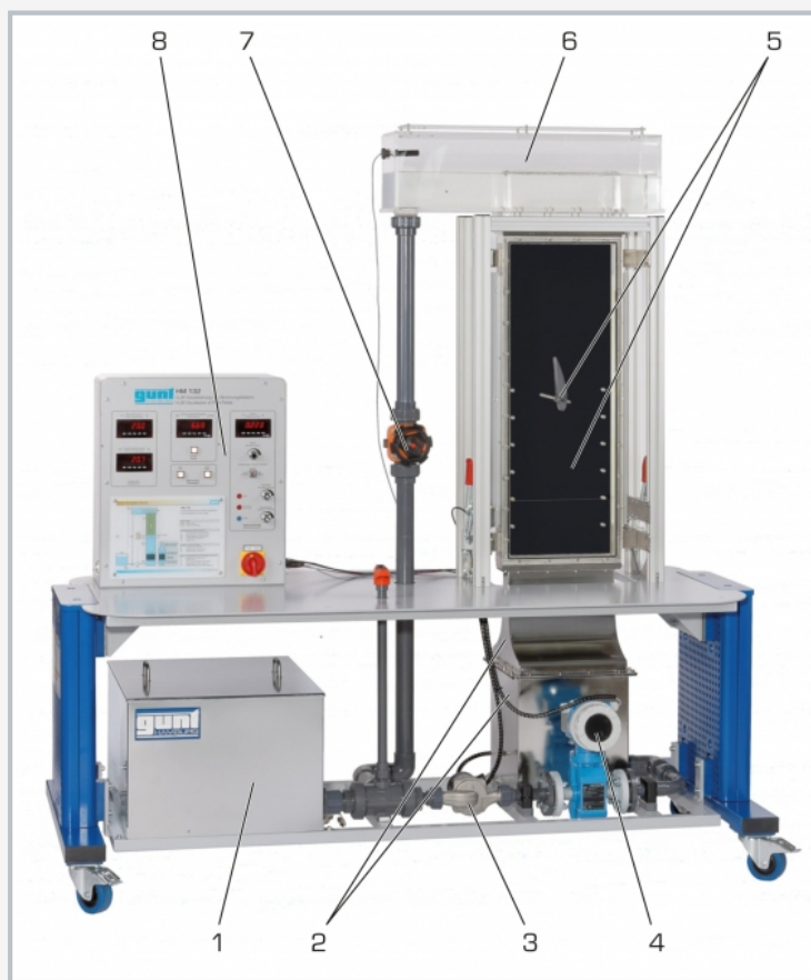
1 storage tank, 2 stabilisation tank with nozzle, 3 pump, 4 flow meter (indirect measurement of flow velocity), 5 illuminated experimental section with inserted model, 6 degassing tank, 7 valve to adjust the flow velocity, 8 switch cabinet with display and control elements