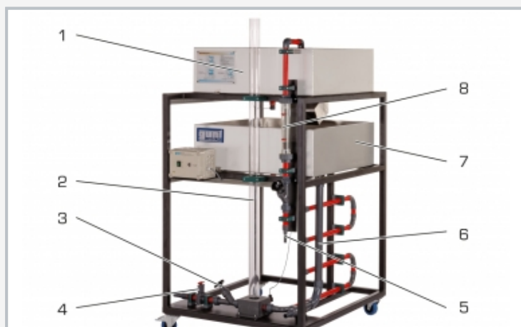
1 basin A with adjustable weir, 2 surge chamber, 3 valve in drain pipe, 4 gate for generating water hammer, 5 water connection, 6 overflow pipe, 7 basin B with overflow, 8 flow meter