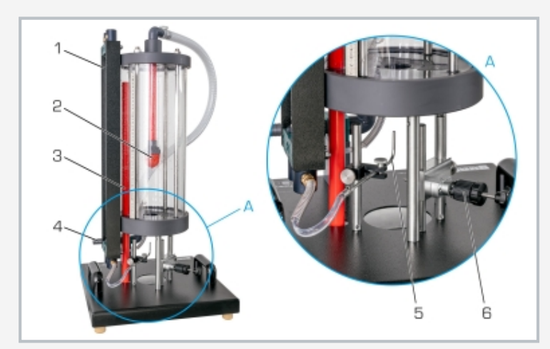
1 inlet strainer, 2 water connection, 3 overflow, 4 twin tube manometers, 5 Pitot tube, 6 measuring device for jet diameter