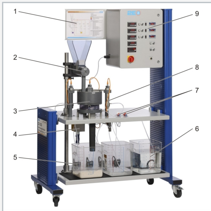
1 process schematic, 2 spiral conveyor for extraction material, 3 revolving extractor, 4 revolving extractor drive unit, 5 pump (behind the tanks), 6 tank, 7 mode selector valves, 8 heater and solvent feed, 9 switch cabinet with controls