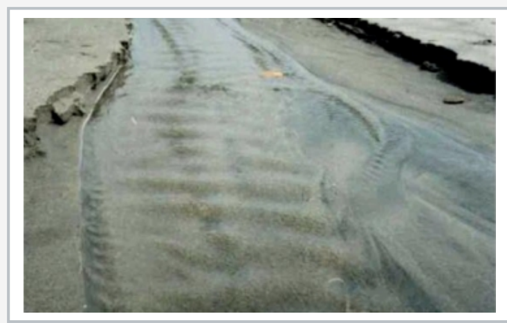
Erosion and scour formation in nature