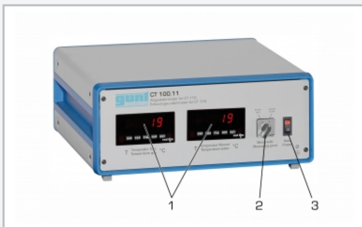
Measuring amplifier: 1 digital displays for exhaust gas and cooling water temperatures, 2 inlet/outlet reversing switch, 3 power switch