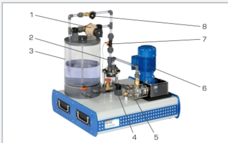
1 overflow valve, 2 pressure sensor at outlet, 3 water tank, 4 air vessel, 5 piston pump, 6 motor, 7 flow meter, 8 needle valve for adjusting the flow rate