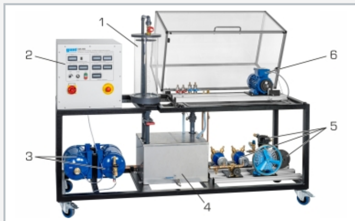
1 measuring tank, 2 displays and controls, 3 stabilisation and pressure vessel, 4 supply tank, 5 pumps and compressor, 6 drive motor