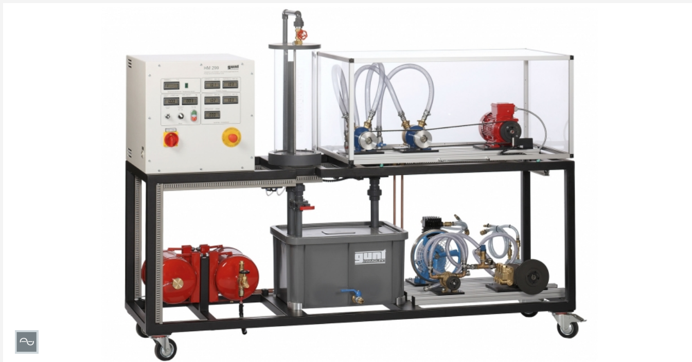
The illustration shows a similar unit