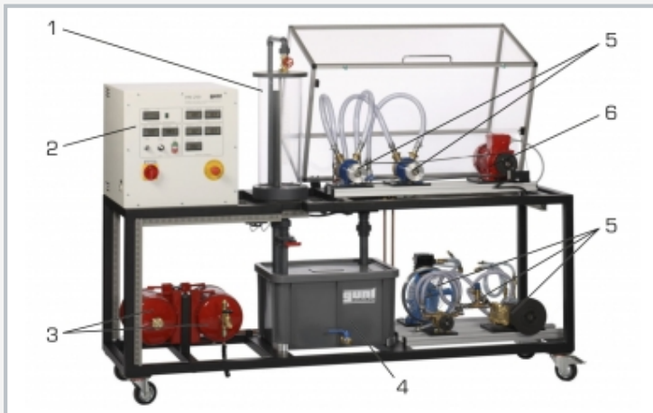
1 measuring tank, 2 displays and controls, 3 stabilisation and pressure vessel, 4 supply tank, 5 pumps and compressors, 6 drive motor